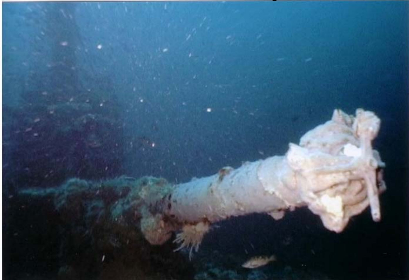
July 2006

Imaging and annotation by the Wahoo Project Group www.usswahoo.org