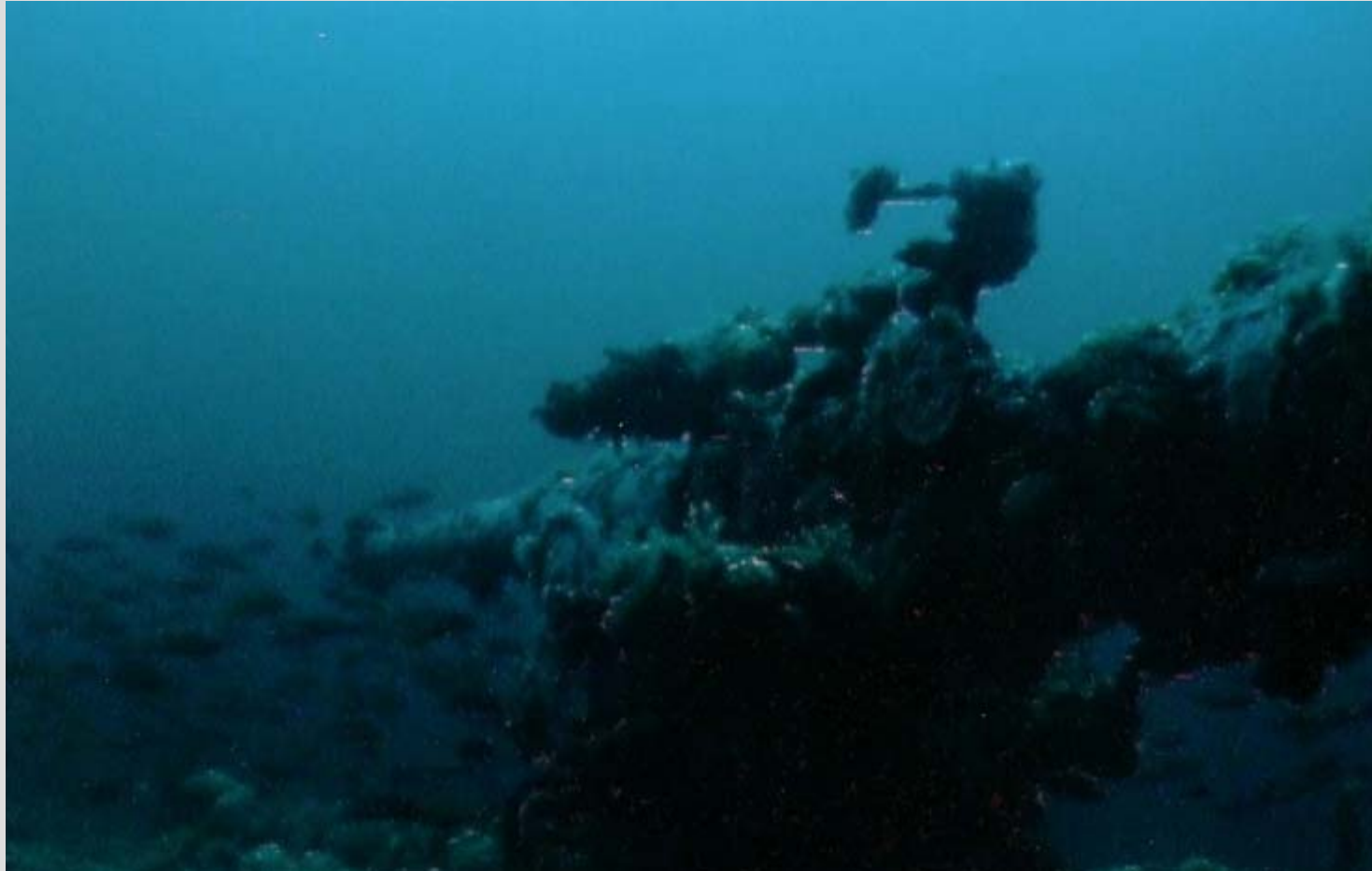
July 2006

Imaging and annotation by the Wahoo Project Group www.usswahoo.org