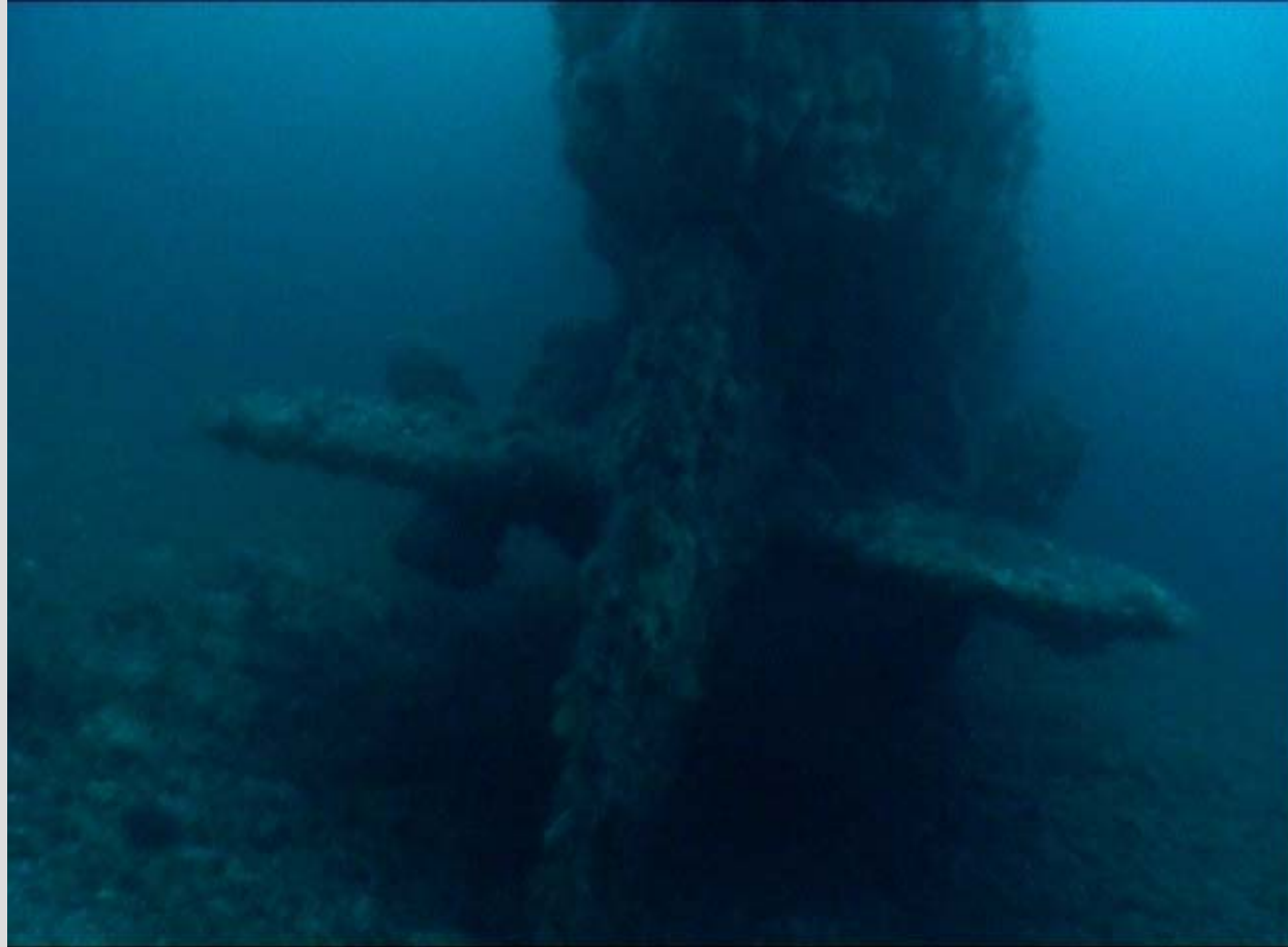
July 2006

View of the stern diving planes, propellers, and rudder